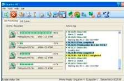
Mito's Job Processing